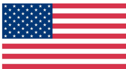
Funding provided by U.S. Embassy Belmopan

Printing and binding of Ocean Academy’s Student Handbook was generously facilitated by a CARSI ESF grant from the U.S. Embassy Belize.